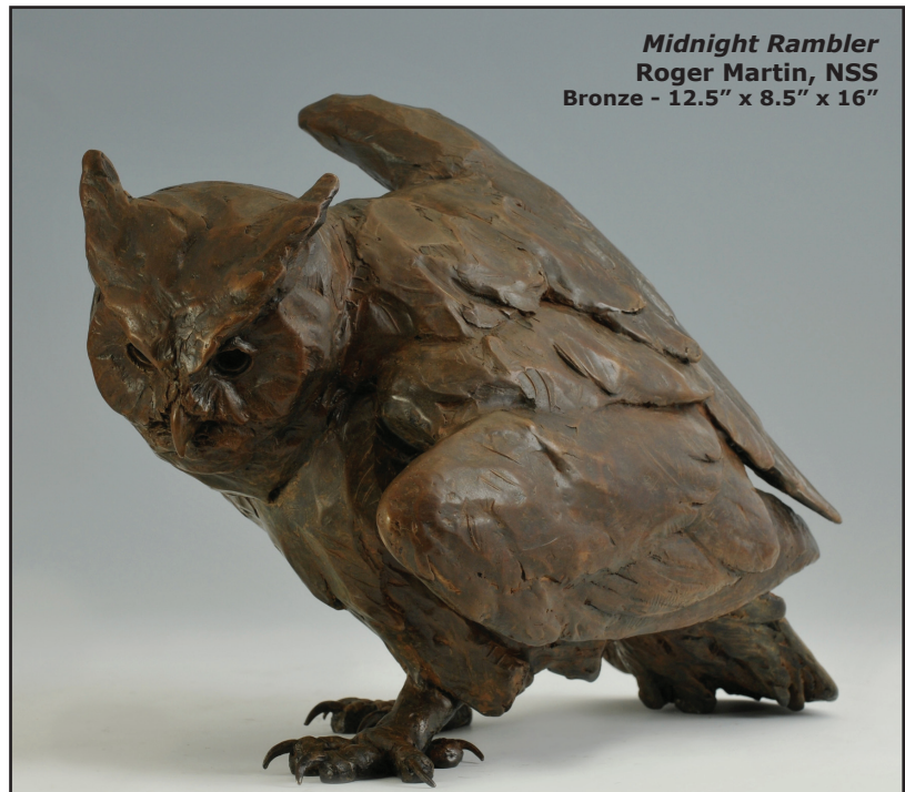
Midnight Rambler Roger Martin, NSS Bronze - 12.5" x 8.5" x 16"

Know everything you possibly can about your subject matter... then make it your own.